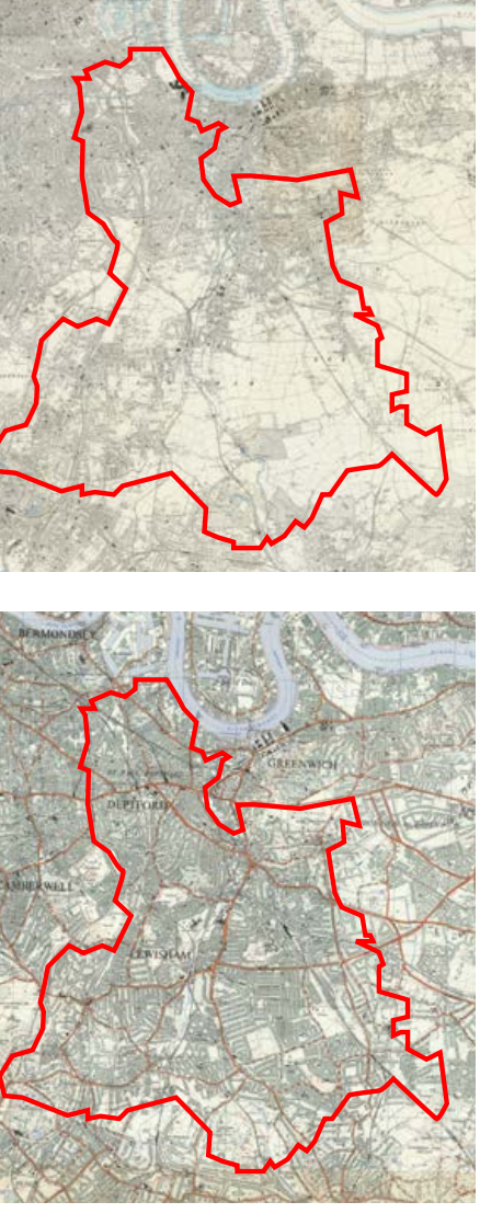
Fig. 8: The growth of Lewisham's suburbs between the 1880s and today

This document sets out a vision for development and intensification of small sites as an intrinsic part of this growth. Its aim is to ensure that the suburbs develop sustainably, and in ways that enhance the quality and character of Lewisham's neighbourhoods.