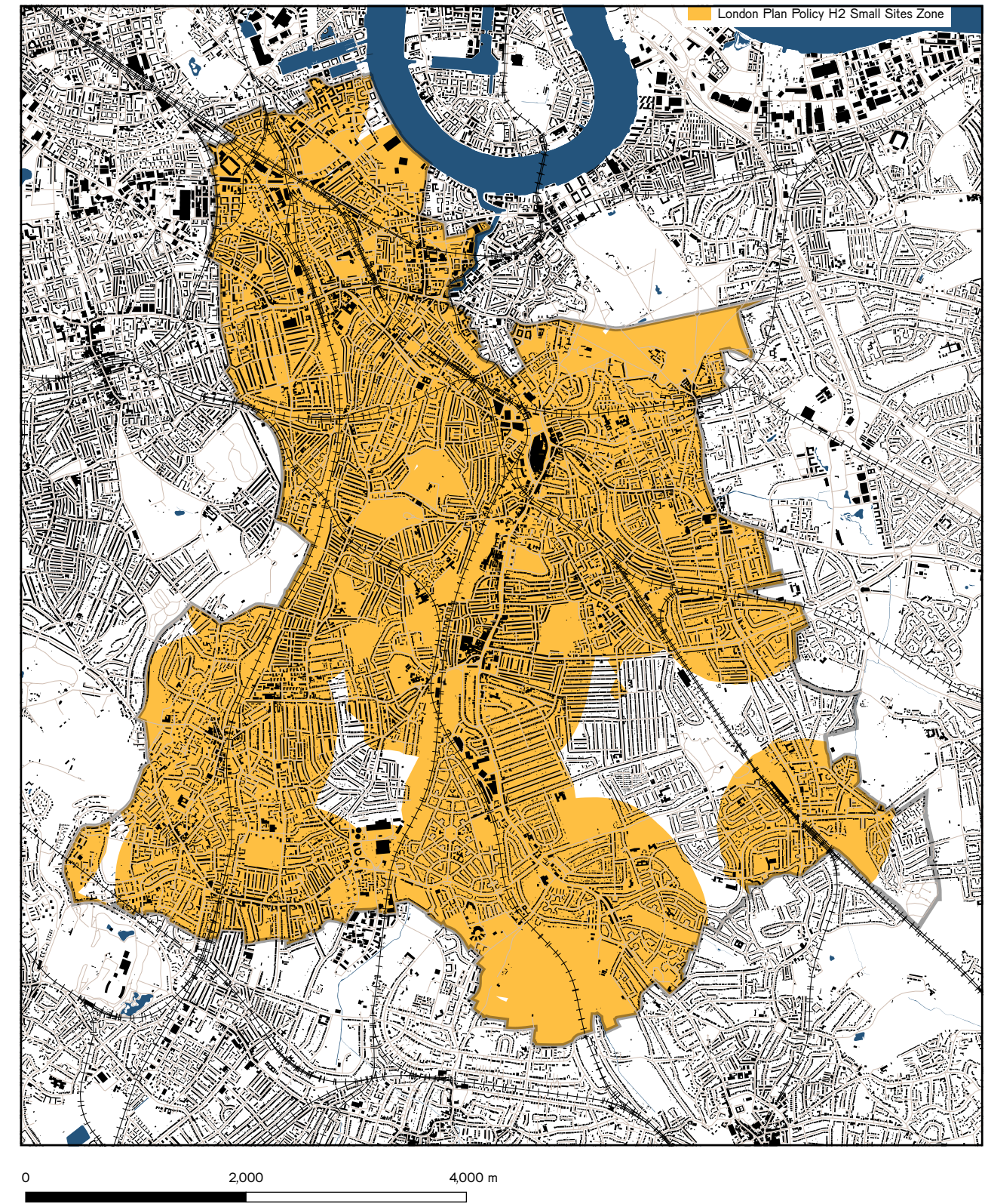
Fig. 10: Map of Lewisham and the surrounding areas showing the Policy H2 area and areas close to a cycleway