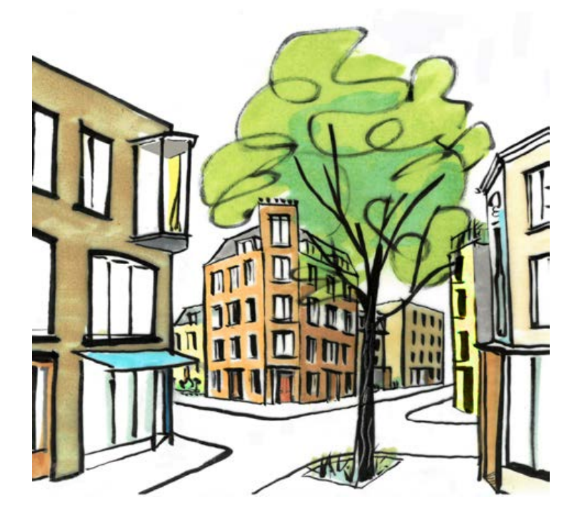
Fig. 9: Example of small sites housing

Further detail on mapping and identified areas for intensification can be found in Part 3: Appendices.