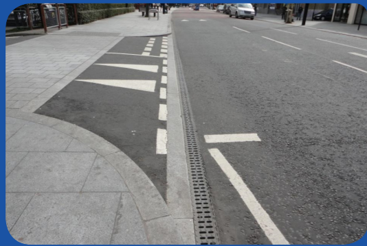
Proposed continuous footway

Give-way marking set back beyond continuous footway